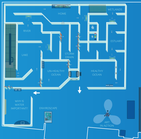
Cleveland Metroparks 1800 sq ft gallery 1450 sq ft exhibit footprint