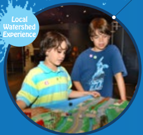
Local Watershed Experience