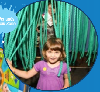
Wetlands Slow Zone