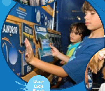
Water Cycle Puzzle