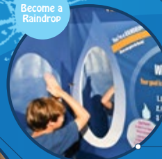
Become a Raindrop