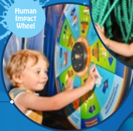
Human Impact Wheel