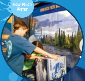
How Much Water