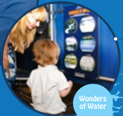
Wonders of Water