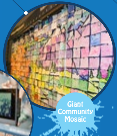
Giant Community Mosaic