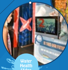
Water Health Video