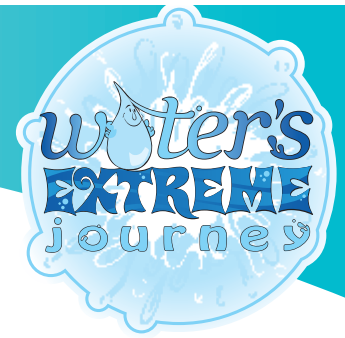
Exhibit Specs - Indoor Version