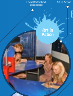
Art in Action